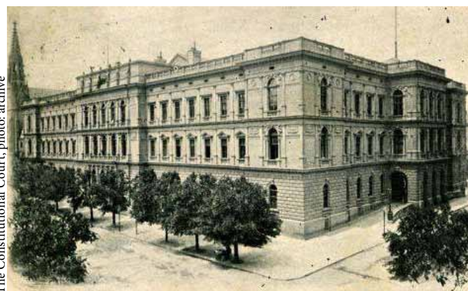
The Constitutional Court