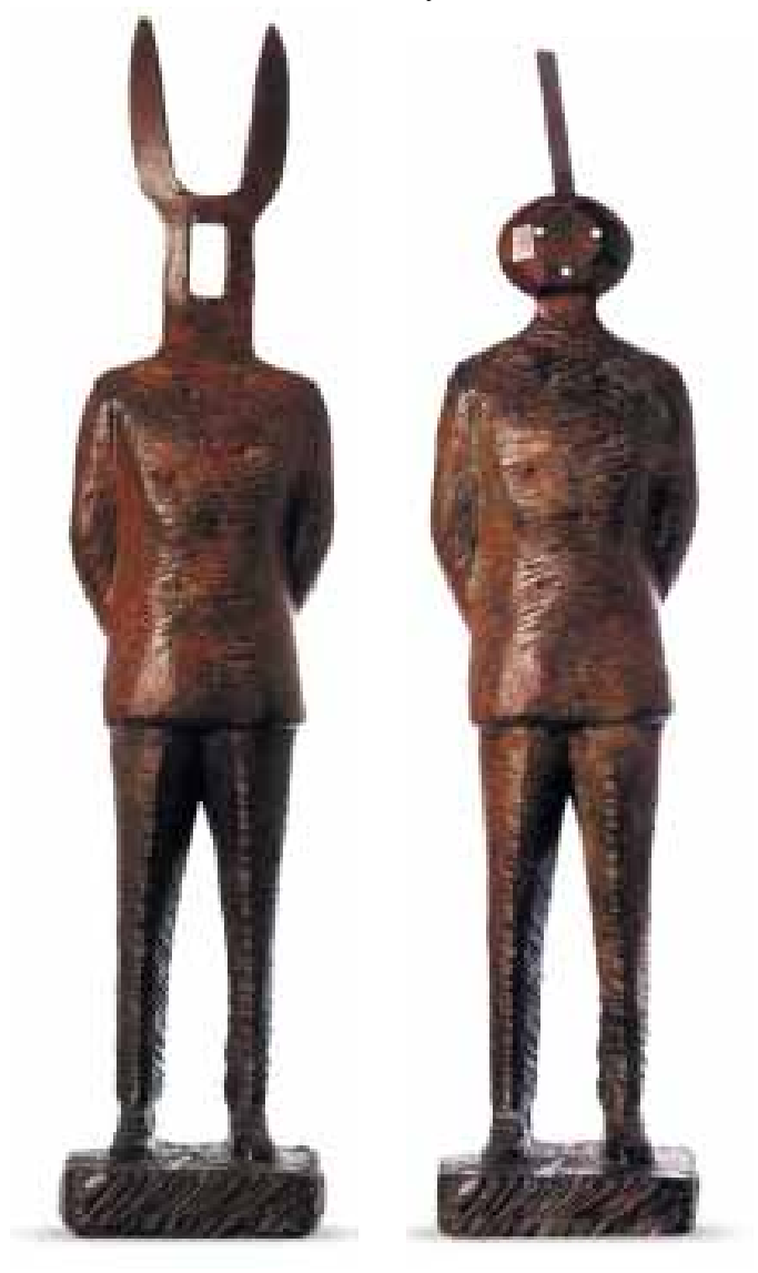
Avenue of Thoughts (Jean-Michel Folon)

The Czech Centre for Human Rights and Democratization sent the Slovakian Ministry of Interior its reservations on the settlement of the situation.