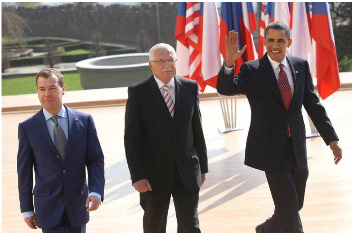
Czech president V. Klaus (in the middle), photo: Prague Castle web page

First of all, the label “opt-out” is completely misleading in relation to the content of the Protocol No. 30 on the application of the Charter of Fundamental Rights of the European Union to Poland and to the United Kingdom which should also apply to the Czech Republic once the amendment is included in primary law. The Protocol does not state anything about possible exclusion of the application of the Charter of Fundamental Rights in the relevant member states. From the text of the Protocol, only some limitations could be deduced as far as the application of the Charter is concerned. Article 1, Paragraph 1 of the Protocol states: “ The Charter does not extend the ability of the Court of Justice of the European Union,