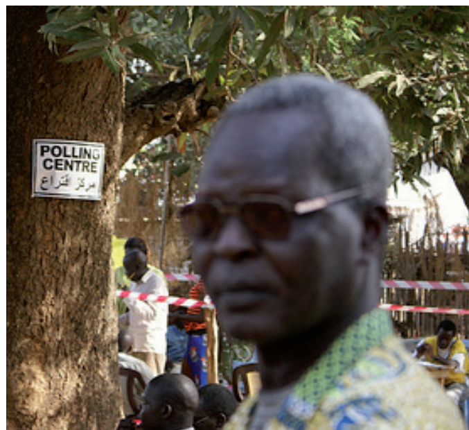
A man waiting outside a polling centre in South Sudan.