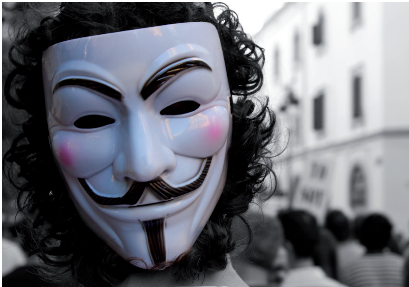
The ruling provides for more anonymity on the internet.

Moreover, the provisions did not specify the purpose of the disclosure of the retained data to the authorised bodies. Even though the EU data retention directive specifies its purpose as the investigation, detection and prosecution of criminal offences, the Czech legislation did not contain the requirements for the provision of the data to the authorised bodies. The use of the data was not conditioned with the existence of reasonable suspicion or with further notification of the persons that they were under surveillance. Because of these facts, the authorised bo-