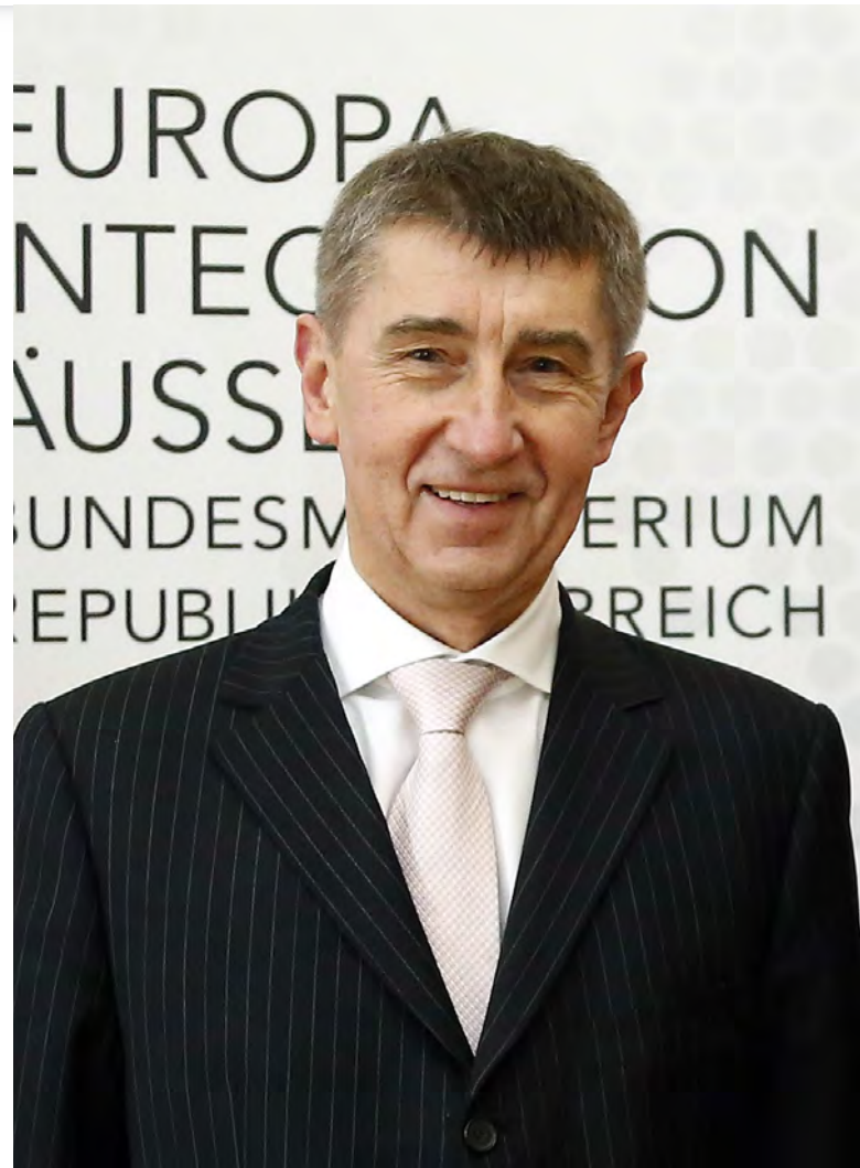
Andrej Babiš [1]

In Slovakia, the files of ŠtB officers and collaborators were open to the public only in 2002, with the establishment of the Nation's Memory Institute (NMI), an important institution responsible for revelation of truth. A similar institution was created in the Czech Republic in 2007, with a rather controversial name, the Institute for the Study of Totalitarian Regimes.