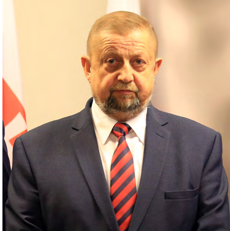
Štefan Harabin [1]

Mr. Harabin, a former Chief Justice of the Supreme Court in 1998–2003 and first Chair of the Judicial Council (2001–2003), became the Minister of Justice after the 2006 parliamentary election by a direct transfer from the posi-