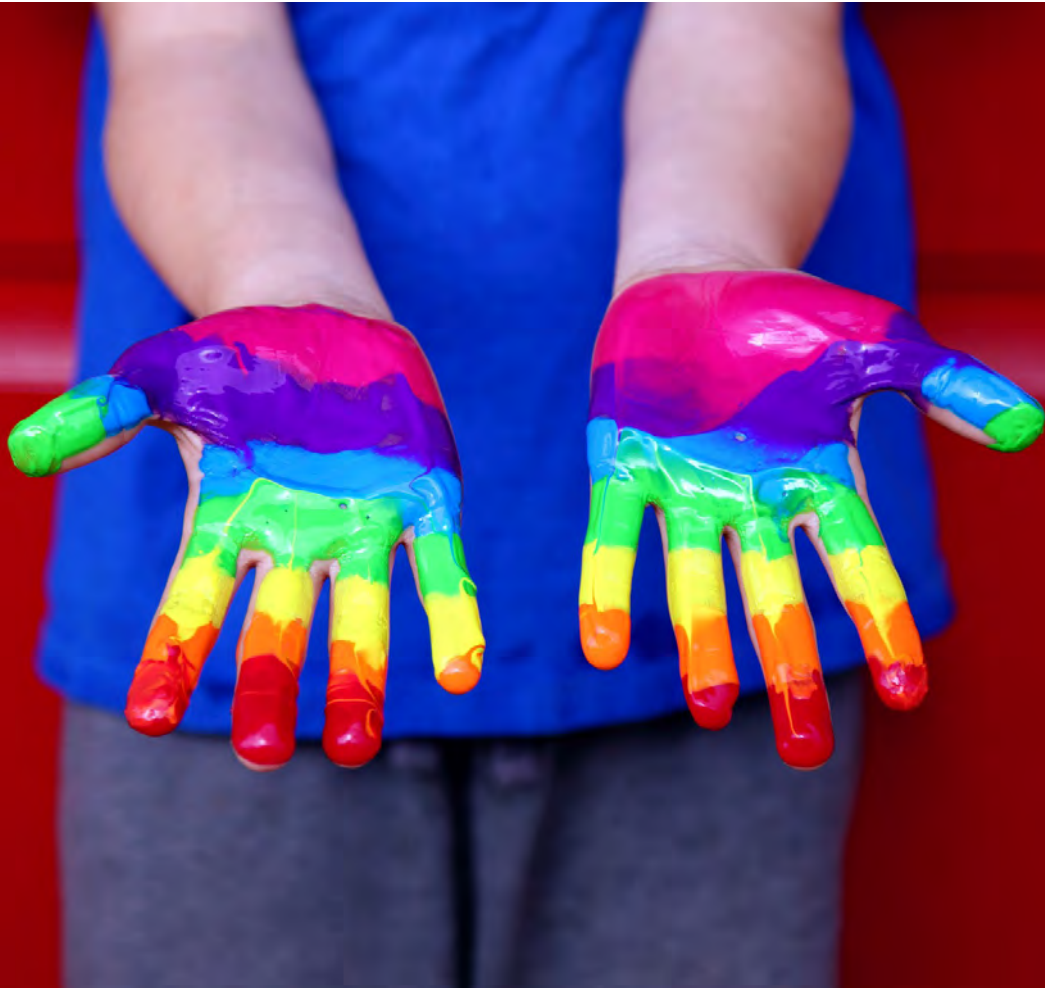
Illustration image [2]

Council of Europe. The Czech Republic signed this Convention in 2016 and should have ratified it in the first half of 2018. However, this task has not been accomplished to this day.