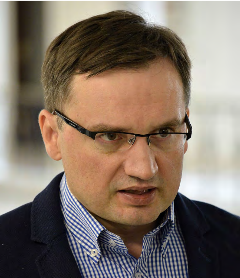
Mr. Zbigniew Ziobro, Minister of Justice [3]

highly controversial legal and institutional arrangements. Although the Senate (upper house of the Parliament) rejected the much-criticized bill, the Sejm (lower house) overruled the Senate's resolution and the bill was sent to the President for his signature. The Bill was signed by the President, promulgated and entered into force on 14 February 2020, with the exception of two provisions.