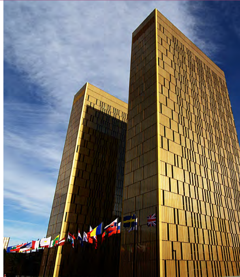
European Court of Justice [1]

The Labour Chamber of the Supreme Court asked the Court of Justice of the European Union (CJEU) by means of the preliminary ruling procedure to decide whether the