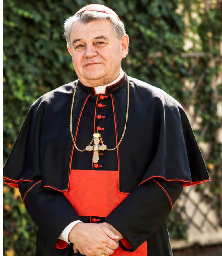
Dominik Duka [1]

In addition, a civil lawsuit was initiated by Cardinal Dominik Duka and his lawyer, who filed a false light action, arguing that these plays grossly offended their religious belief, dignity, and honour, as well as religious belief of all Christians and the Christian faith as such. Since they lost their case at the court of first instance, they filed an appeal to the Regional Court in Brno (hereafter referred to as the “regional court” or “the court”).[1]