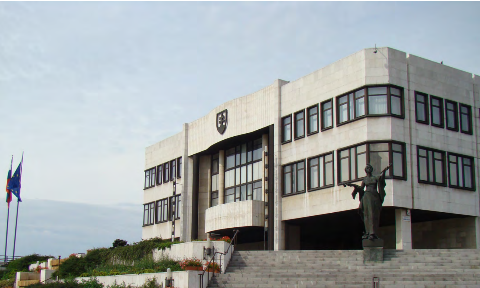
The seat of the Slovak parliament (National Council) [3]