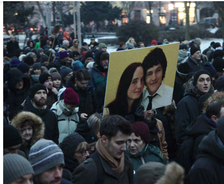
Demonstration in memory of murdered journalist and his fiancée [5]

ussion about the limits of ethical behaviour, then judges do not know how to react when faced with a dilemma.