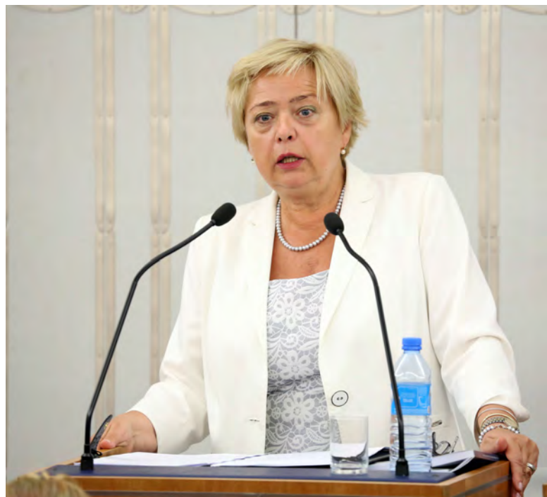
Ms. Małgorzata Gersdorf, First President of the Supreme Court [4]